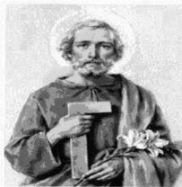
Saint Joseph the Worker