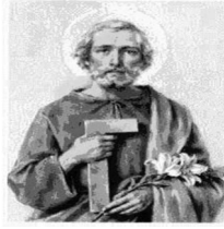
Saint Joseph the Worker