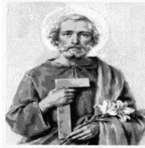
Saint Joseph the Worker