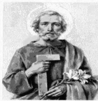
Saint Joseph the Worker